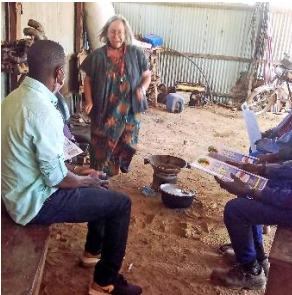
Mechanics in garages outside Mamou!