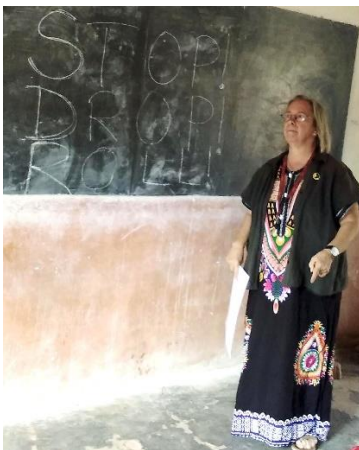
When clothes on fire: "STOP! DROP! ROLL!" In 5 languages: Pular, Sousou, Mananke, French, English